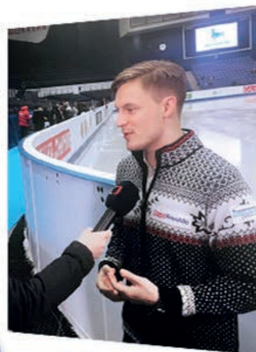
Ambassador of event Tomáš Verner gold medal winner of European Figure Skating Championships 2008