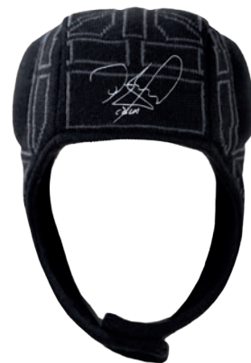
Petr Čech football keeper