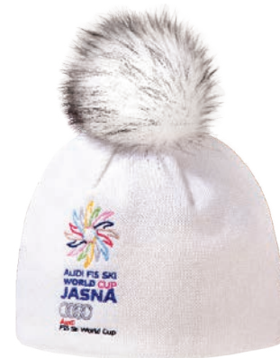
Jasna FIS world cup